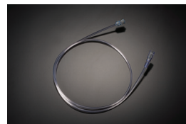
TAG C120 HPCT & TAG C150 HPCT**

*Refer to the Operator Manual for a description of the intended use, contraindications, warnings and instructions for use.