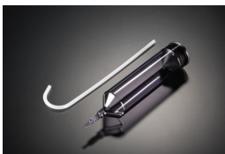
TAG 150 SYR**