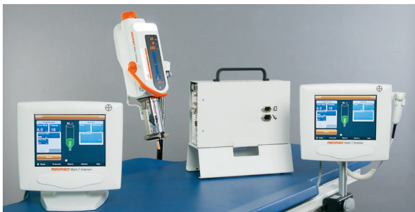
MEDRAD® Mark 7 Arterion Table Mount with Dual Monitor Option**

*Display control unit can be mounted on a desk, table or wall.