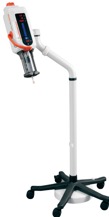
Freestanding Pedestal on Wheels or Adjustable Height Pedestal on Wheels

**Multiple mounting options are available for dual display. Please refer to page 8.