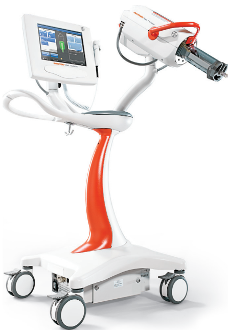
MEDRAD® Mark 7 Arterion Pedestal

Each suite is unique. With MEDRAD® Mark 7 Arterion, you can choose the configuration and mounting options for your suite and imaging system to optimise your workflow.