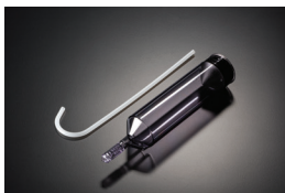
ART 700 SYR