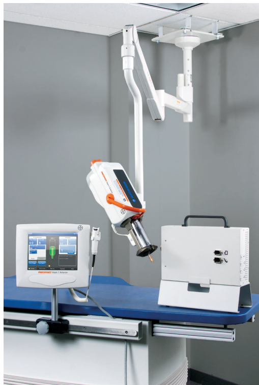
MEDRAD® Mark 7 Arterion Overhead Counterpoise*

*Display control unit can be mounted on a desk, table or wall.