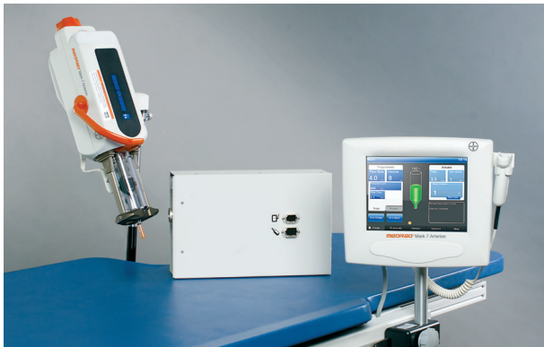
MEDRAD® Mark 7 Arterion Table Mount*