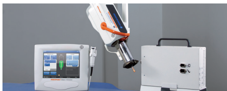
MEDRAD® Arterion Overhead Counterpoise*