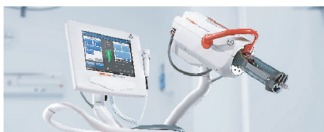
Freestanding Pedestal on Wheels or Adjustable Height Pedestal on Wheels. Additional accessory option to relocate the injector head from the table.