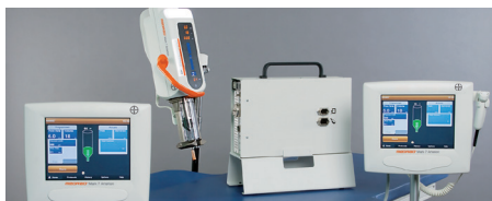
Dual Monitor Option, with any mounting option**